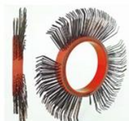
BRISTLE BLASTER® AXIAL BELT, STEEL, 11 MM, LEFT