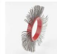
BRISTLE BLASTER® BELT, STEEL, 11 MM