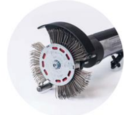
BRISTLE BLASTER® AXIAL