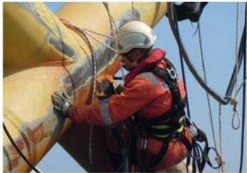
Bristle blaster® on an offshore platform

Absolutely Gründlich stands for a thorough and sustainable long-term protection of your assets. MontiPower®-preparation from scratch!