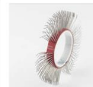
BRISTLE BLASTER® BELT, STAINLESS STEEL, 11 MM