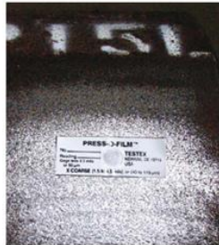
• Bristle Blaster® • Near- white/White metal • 1.1 m²/hr