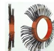
BRISTLE BLASTER® AXIAL BELT, STEEL, 11 MM, RIGHT