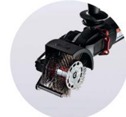
BRISTLE BLASTER® DOUBLE