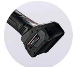
BRISTLE BLASTER® CORDLESS