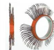
BRISTLE BLASTER® AXIAL BELT, STAINLESS STEEL, 11 MM, RIGHT