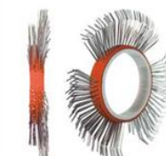
BRISTLE BLASTER® AXIAL BELT, STAINLESS STEEL, 11 MM, LEFT