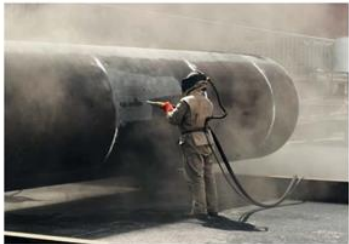
Conventional grit blasting