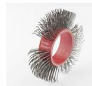
BRISTLE BLASTER® BELT, STEEL, 23 MM