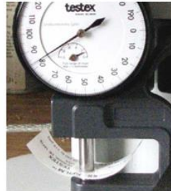
• 83 µm Rz (3.3 mil)

THE BRISTLE BLASTER® OFFERS DISTINCT ADVANTAGES OVER CONVENTIONAL SURFACE PREPARATION METHODS AND WILL YIELD SUPERIOR RESULTS – WITH FAR LESS TIME AND EFFORT.