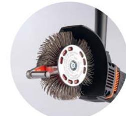
BRISTLE BLASTER® ELECTRIC