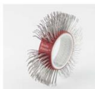
BRISTLE BLASTER® BELT, STAINLESS STEEL, 23 MM