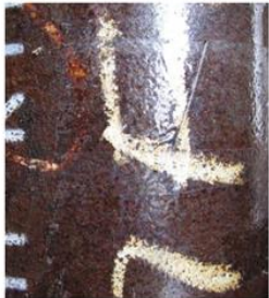
API 5L Piping